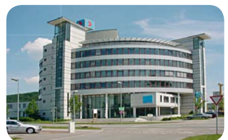
sds branch office in Leonberg