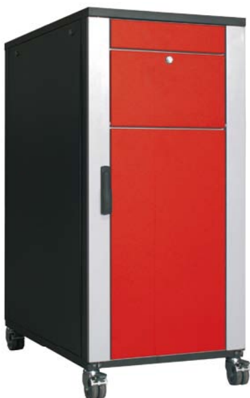
Powerful and robust: The sds Compact Center

The sds Virtualization Service makes optimum use of all resources, delivering ease of maintenance based on standardized processes. On the software side, a wide variety of applications are provided centrally, enabling unified version management of programs and much more cost-effective administration, among other benefits. Automatic load distribution and high availability ensure maximum performance and stability levels at all times. And sds also offers you "Software as a Service" (SaaS): With it, all you need is a minimal IT infrastructure to access the full scope of software we then provide.